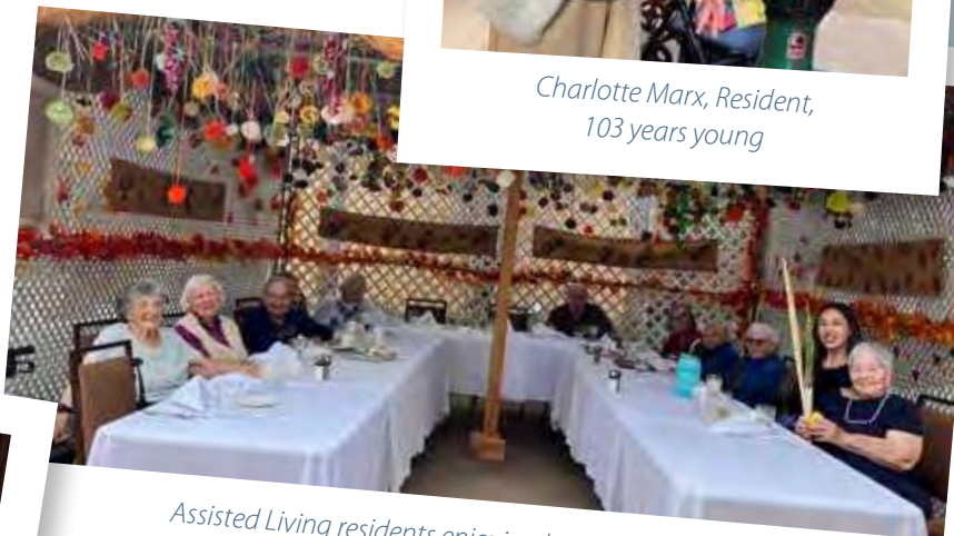
Assisted Living residents enjoying lunch in the sukkah