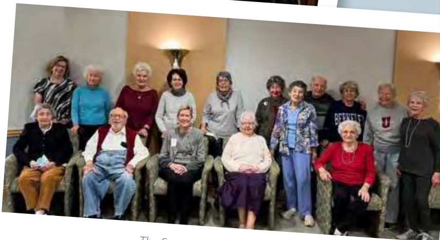
The Seacrest Village Book Club